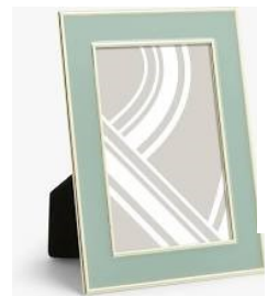
Photo album Photo frame